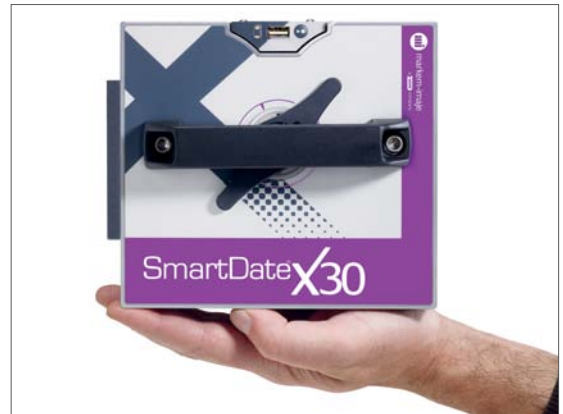
Compact in size for easy integration. SmartDate X30 is the smallest of SmartDate coders.

Gain direct access to one single point of contact for expert support on both your coder and ribbon.