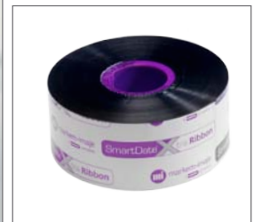
Choose between three ribbon types and a series of accessories according to your package type and needs.