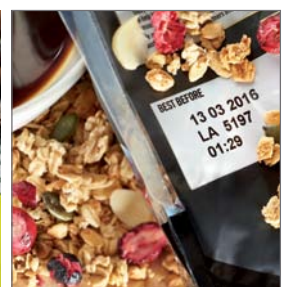
World leading service to guarantee uptime and quality coded products.

*Compared to other competitive models. **See conditions defined by Markem-Imaje.