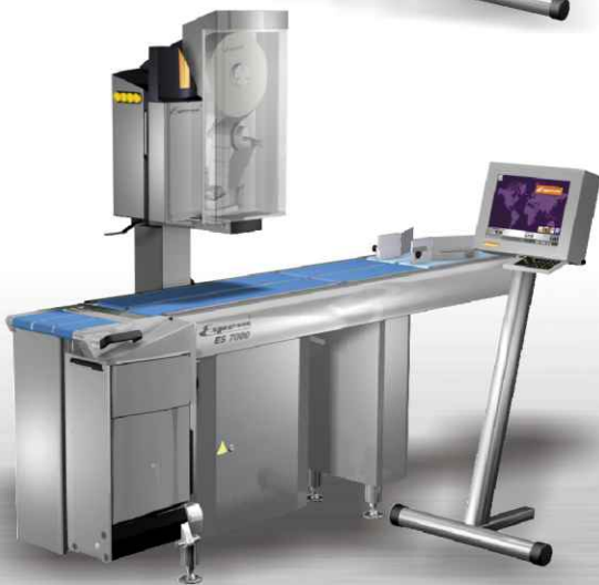
ES 7011 in IPX4 version