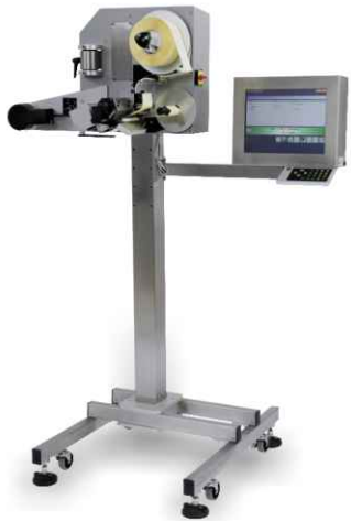
ES 9300 Print & Apply solution for any conveyor system

For fast labelling of products with changing label information. This range covers models from the standalone printer up to multi roller printer that can apply several labels in one cycle only up to models that can be integrated in existing machines.