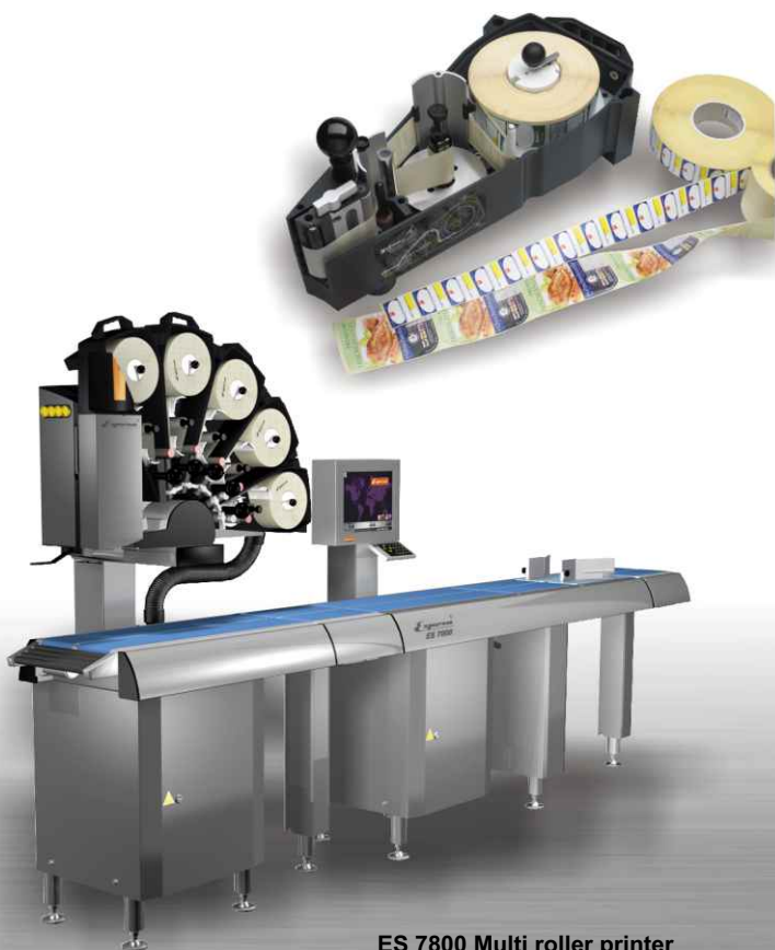
ES 7800 Multi roller printer

With only one printer and labelling system, but with 5 fan-shaped cassettes for different labels, the ES 7800 can label goods without loss of time for article or label change. Thereby one product can be labelled individually non-stop or different products will be labelled with different labels: The multi roller printer opens up new possibilities for an efficient and space-saving weigh price labelling system – all at a convincing price performance ratio.