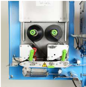
Easy change of the thermal transfer ink ribbon